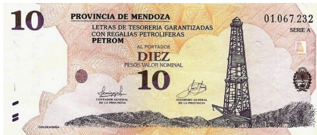
Figure 19.2 A Petrom note of Mendoza province

The note shown in Figure 19.2, called a “Petrom,” was a currency issued by the Argentine province of Mendoza on the basis of its petroleum royalty income which was used at some point to redeem them. But as we have described above, such provincial or state currencies could also be issued on the basis of revenues received from any source.